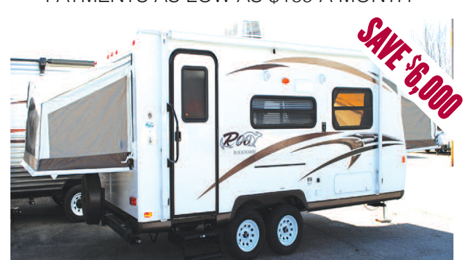
New 2015 Rockwood Lite Weight Travel Trailer RLT 19 ROO Roof A/C, outside grill, heated mattresses, power tongue jack.