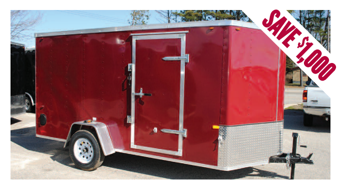
New 2014 Interstate 1 Wedge Nose 6x12 Cargo Trailers SFC612SAFS Wedge Nose Cargo Trailer by Interstate 1, Rear Ramp Door, Front Diamond Plate, 14" Platform Height, Spring Axle & Much More