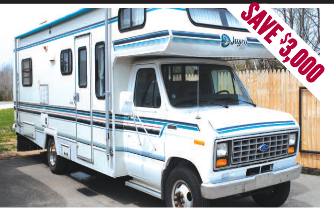
Used 1992 Jayco Jay Series 2700IB.

Ford Chassis, Rear Queen Bed, 48,000 miles, Generator, Dinette, Bath, Wardrobe Storage, Front Overhead Bunk, Much More.