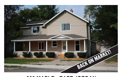
308 MAPLE • EAST JORDAN This 4BR home has been newly remodeled, has new flooring throughout and has been freshly painted. MLS 438295. Ask for