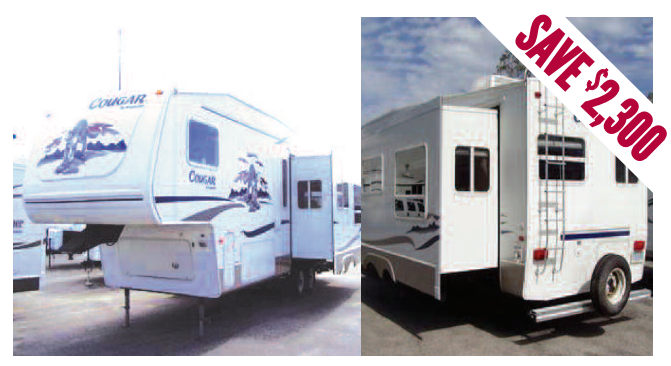
Used 2005 Keystone RV Cougar 286 EFS Fifth Wheel Double Slide, Rear Kitchen Slide, Sleeps 6, Queen Bed, Sofa Bed/Dinette, Chair, Refer, Range, Micro, Neo Angle Shower and much more!