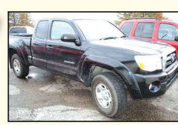
2007 TOYOTA TACOMA PreRunner SR5. V-6, tow pkg, extended cab, one owner. $225 A MONTH OR LESS