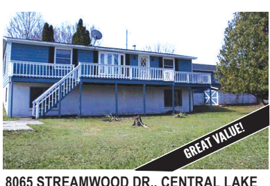
8065 STREAMWOOD DR., CENTRAL LAKE Newly remodeled ranch style home in the quaint Village of Central Lake. Walking distance to down town and park with Hanley Lake close by. MLS 439266. Ask for Holly Nierman. $89,900