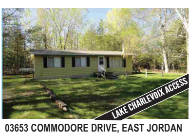
03653 COMMODORE DRIVE, EAST JORDAN Friendly communtiy with private boat slips, sandy beach and family picnic area. Three BR, 1.5BA w/ Lake Charlevoix access! MLS 436953. Ask for Mike Stark. $106.900