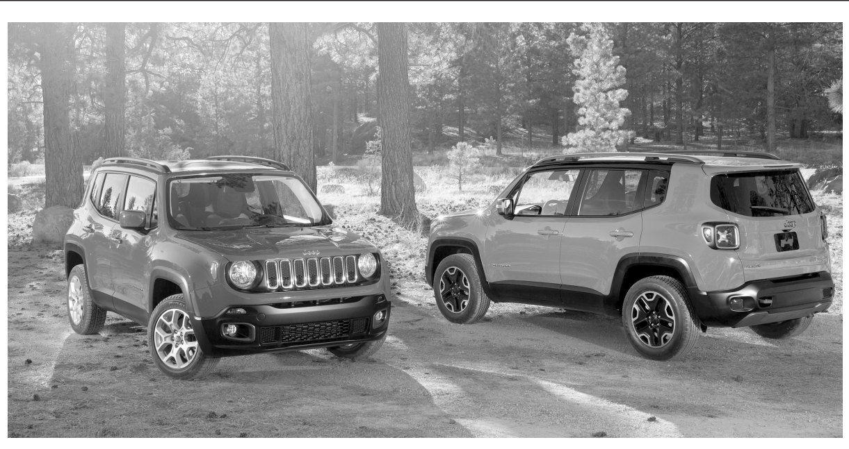
The 2015 Jeep® Renegade expands the brand's vehicle lineup, entering the growing small sport-utility vehicle (SUV) segment, while staying true to the adventurous lifestyle and 4x4 capability Jeep is known for.