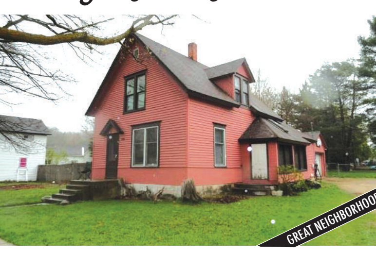
704 PROSPECT STREET, EAST JORDAN • $49.900 Older home in a nice area of town. Home could use some updates, but has lots of charm as is! Enough space for a starter home or even an investment property! Walking distance to schools, town and marina. Great price! Call for a tour today! MLS 440483.