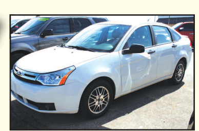
2011 FORD FOCUS 35 MPG. Looks and drives like new. $189 A MONTH OR LESS