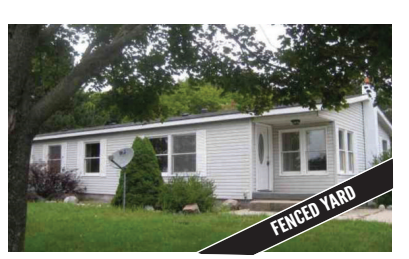
803 OLSON ST, EAST JORDAN Nicely updated with fresh paint and new Wood floors, fireplace in basement, fenced back yard and large deck. MLS 439274. Ask for Mike Stark. $74,900