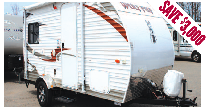
Used 2013 Forest River RV Cherokee Wolf Pup 17B

Cherokee Grey Wolf Pup Travel Trailer by Forest River, Booth Dinette w/Overhead Cabinets, LCD TV Mount Above Windows, Refrigerator, Wet Bath, Kitchen Sink, 2 Burner Cook Top, Front Queen Bed w/Exterior Storage.