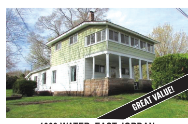
1009 WATER, EAST JORDAN Nice home on the edge of East Jordan, Two car detached garage, Paved drive. Large lot with lots of room for the kids to play. MLS