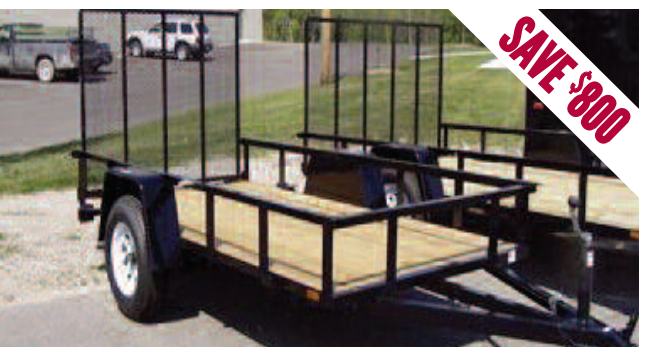
New 2014 Forest River RV Open Steel Angle Iron Trailer usasg510sa Open Steel Angle Iron Trailer by Forest River, 5x8 Single Axle w/Gate, 3500 LB Axle, Treated Deck, Fold Flat Rear Gate, DOT Approved Lights, Triple Angle Tongue & Much

Sale $1,195 SUGG. PRICE: $1,995 YOU SAVE: $800 PAYMENTS AS LOW AS $69 A MONTH