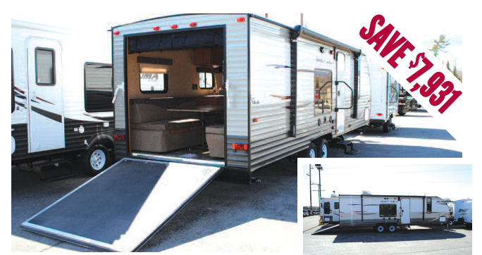
New 2015 Cherokee Grey Wolf Travel Trailer 26RR. Toy Hauler, power awning, power tongue jack.