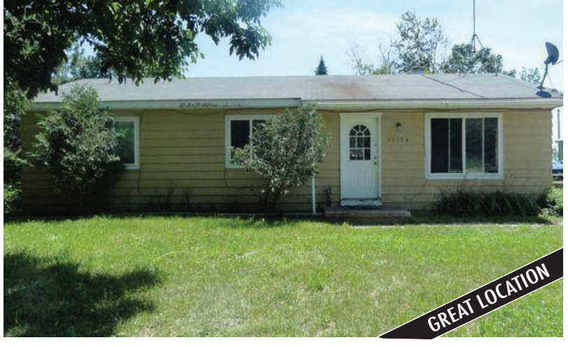
5178 NORWEGIAN ROAD, EAST JORDAN •$59,900

Nice ranch style home just outside of town. Whether you're looking for a first home, a second home or an investment property, this home is move in ready and will fit the bill! Call today to schedule your showing! MLS 440482. Ask for Jennifer Burr.