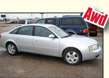
2003 AUDI A-6, 3.0 QUATTRO AWD, pwr. moonroof, dual climate control. SALE PRICE $7,995