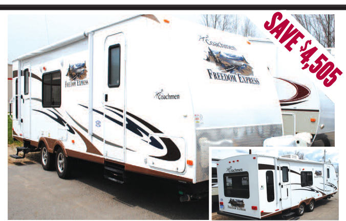
Used 2012 Freedom Express 280 RLS Travel Trailer

Sale $1,195 SUGG. PRICE: $1,995 YOU SAVE: $800 PAYMENTS AS LOW AS $69 A MONTH