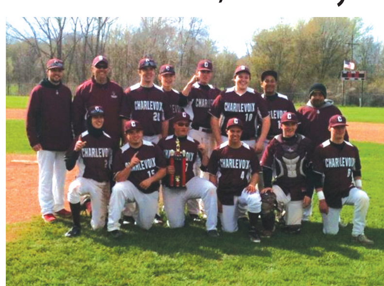
The Charlevoix Rayder baseball team poses with the trophy they captured with a pair of wins at the Whittemore-Prescott Cardinal Invitational.

picked up the win on the mound, working five innings, allowing one run on one hit, walking three and striking out six.