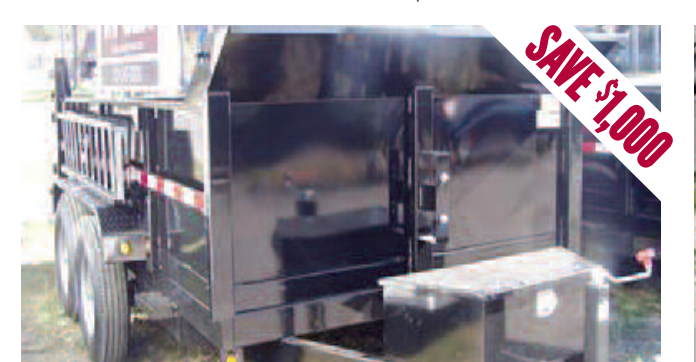
New 2014 Interstate 1 6.5' x 12' Dump Trailer, Griffin 68x12 Tandem Axle Heavy Duty Dump Trailer. Twin Cylinder, Powder Coated, 2 Way Gate, Heavy Duty Ramps, Monarch Pump, Interstate Battery, D Rings, Load Tarp, Much