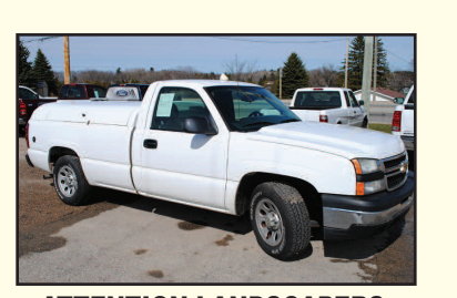
ATTENTION LANDSCAPERS 2006 Chevy Silverado with built in Spray Equipment. Topper, Leather, 4 new tires. $229 A MONTH OR LESS