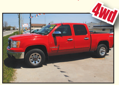
2009 GMC SIERRA 1500 4WD, 4 door, bedliner, tow pkg, seats 6. SALE PRICE $17,995